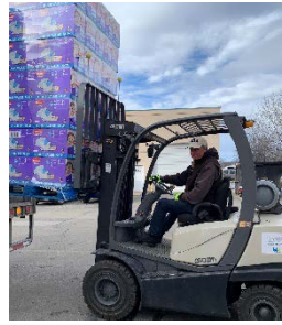
MEET THE NEED COLLECT & DISTRIBUTE DIAPERS