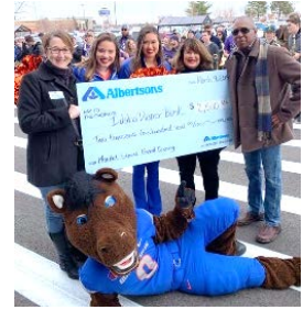
SUSTAINABILITY DONOR NETWORK, GRANTS, SPONSORSHIPS