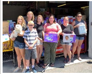
ENGAGE THE COMMUNITY RAISE AWARENESS