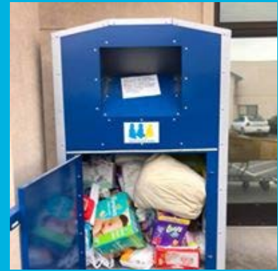
Drop Off Container At Warehouse