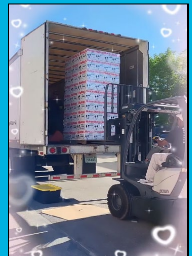
Thank you, Huggies and the National Diaper Bank Network, for the +200K