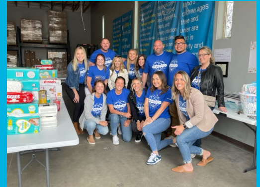
Hayden Homes Diaper Drive